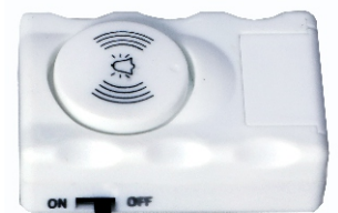
Wireless Alarm On Off Switch