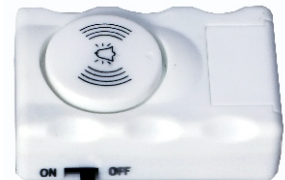
Wireless Alarm On Off Switch